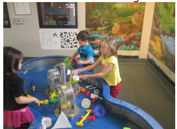
Water Play Fun!