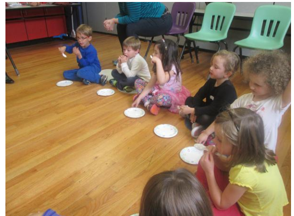
Five Senses Tasting!