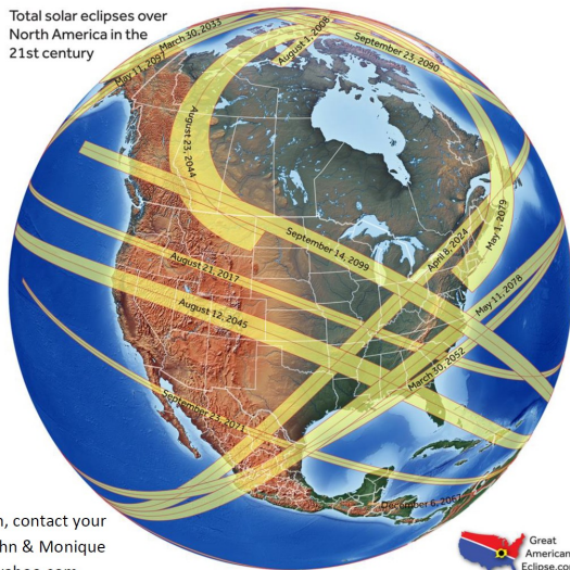
Total solar eclipses over North America in the 21st century