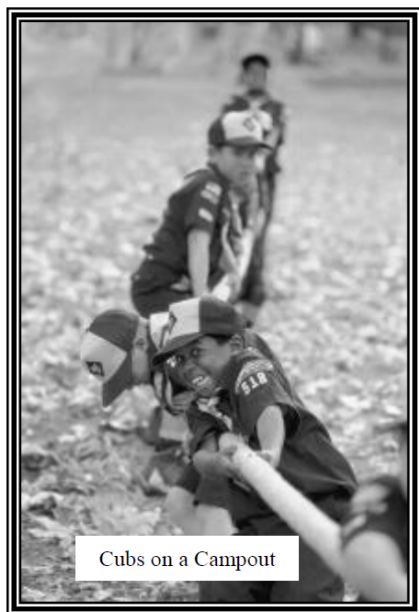
Cubs on a Campout

Here are some of the fun things Cub Scouts do: