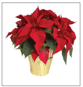
Poinsettia Red - White - Pink 4" - $6 | 7" - $20 | 10" - $40