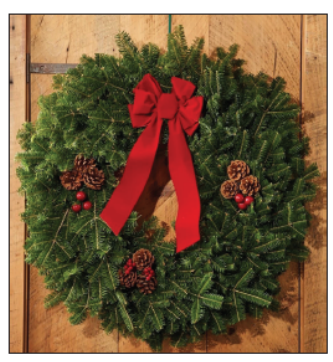
Wreaths with Bows 24" - $45 42' - $80

Please email your orders to: TROOP2950@MIDDLEBURG.COM