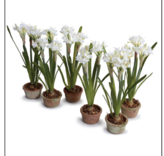
Paperwhites 6" - $15