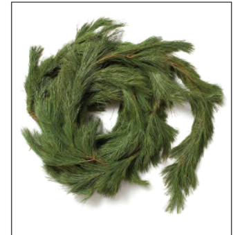
Roping 75' - $35