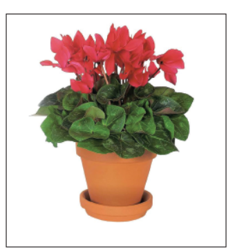
Cyclamen Red - White - Pink 4" - $8