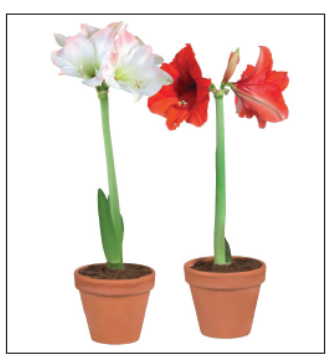
Amaryllis Red - White - Pink 7" - $18