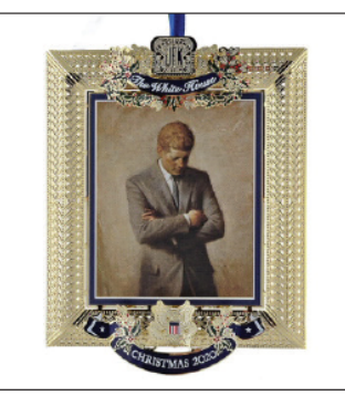
White House Ornament $27