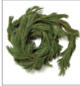
Roping 75' - $35