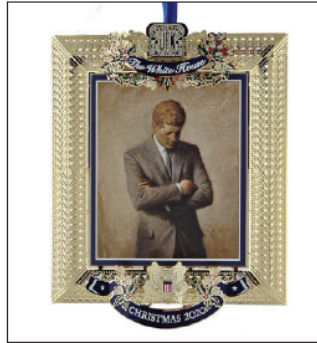
White House Ornament $27