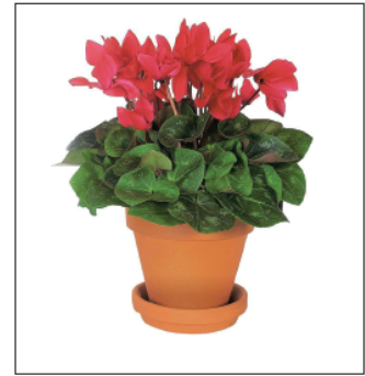
Cyclamen Red - White - Pink 4" - $8