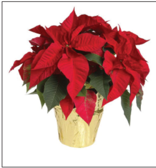
Poinsettia Red - White - Pink 4" - $6 | 7" - $20 | 10" - $40