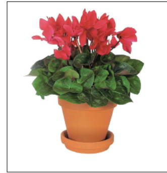
Cyclamen Red - White - Pink 4" - $8