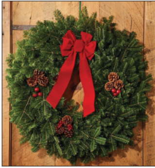
Wreaths with Bows 24" - $45 42" - $80