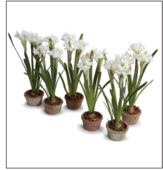
Paperwhites 6" - $15