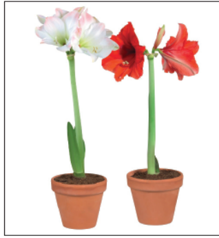
Amaryllis Red - White - Pink 7" - $18