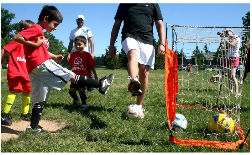
HappyFeet Fall @ Middleburg Community Center

HappyFeet 2's - 3's Saturdays Sept 8th - Nov 3rd 10:00am - 10:30am $130.00