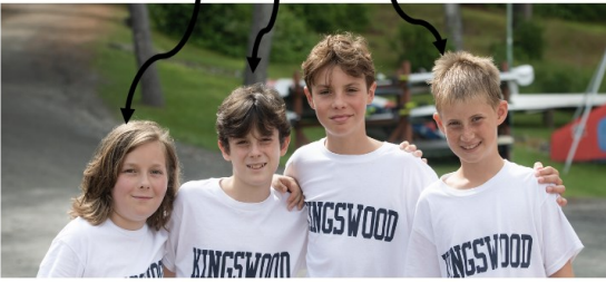
Hill School Class of 2025 and 2026