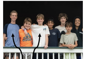
Hill School Class of 2023