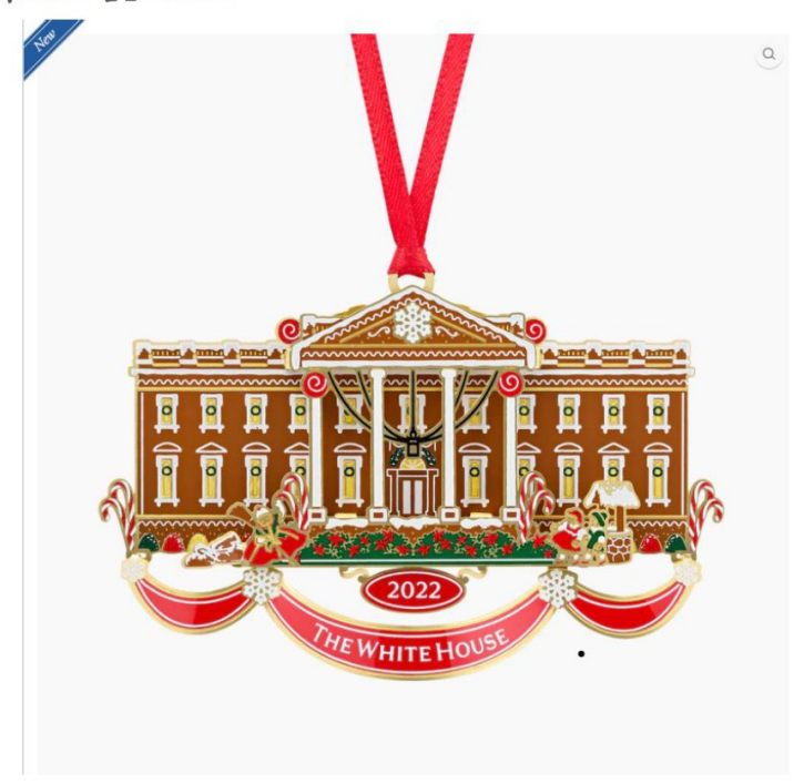
PLACE YOUR ORDER TODAY!

The Official 2022 White House Christmas Ornament represents the cherished White House tradition of displaying a gingerbread house each holiday in the State Dining Room. Included with this beautifully gift-boxed keepsake is a gingerbread scented booklet and recipe card featuring a gingerbread recipe from First Lady Pat Nixon's time at the White House.